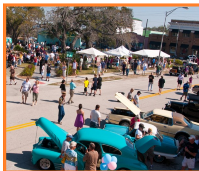
1st Annual Founders' Day Fish Fry, Feb. 2011

The Founders' Day Fish Fry is a revival of the town's historic celebration of George Washington's Birthday from the 1920s-50s.