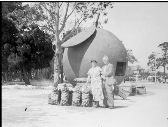
Eau Gallie 1940s?