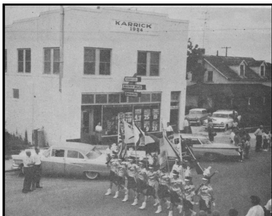
Karrick Bldg., Highland Ave. 1960s