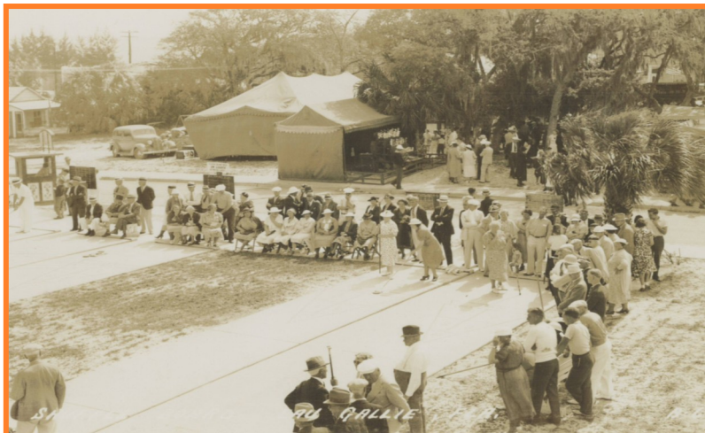
Eau Gallie 1930s, Washington's Birthday Celebration

EGAD PASSPORT available at participating merchants gives you a chance to win $50 EGAD Bucks! See map on back page. Art studios, galleries, museums, shops and restaurants remain open late for a free art walk featuring exhibition openings, demonstrations, receptions and live music, and area artists will set up in Eau Gallie Square.